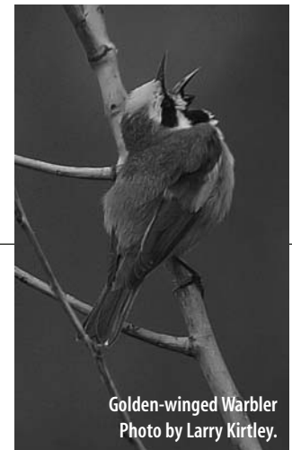
Golden-winged Warbler