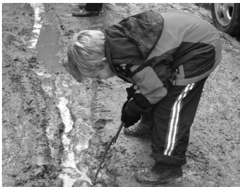
Part of the joy of experiencing Elliott Woods is just playing in the mud.

One topic that will almost certainly be contentious is hunting. While hunting is not appropriate on most of our properties, the donor of Prairie Smoke Alvar had asked the Nature Conservancy of Canada and The Couchiching Conservancy to continue her practice of allowing a limited deer hunt by a local family. For this year, we have honoured that request. This decision did not sit well with some of our members who believe that hunting is never appropriate on any Conservancy property. The management-planning taskforce will be considering the views of Conservancy members and other interested parties on this and all other management issues so we can arrive at the best policies possible. ∞